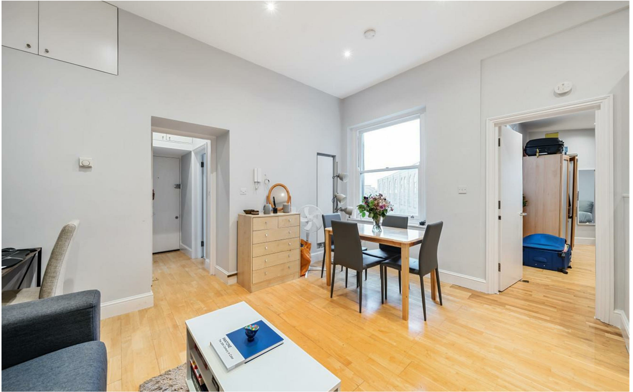
Canfield Gardens NW6